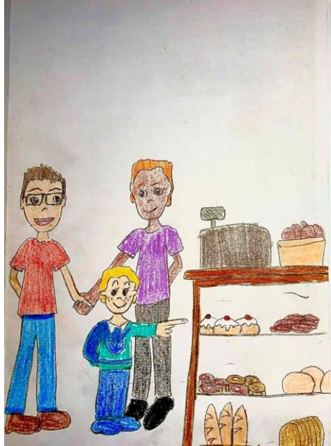
Figure 4: Illustration from Student e-book Maisie's Adventure

The student author of Maisie's Adventure promotes a dialogic view of learning and young children as capable and sophisticated language users, who are able to shape others in the same way they are shaped through dialogue themselves (White, 2017). This suggestion of agency reflects the idea of "children as peers instead of inferiors" (Medress, 2008, p. 23). Much emphasis is placed on dialogue in early childhood education, not least the pedagogy of listening as embedded in the highly regarded Reggio Emilia education approach (Rinaldi, 2006). In addition, the promotion of sustained shared thinking within the UK English Early Years Foundation Stage (English Department for Education (DfE), 2017) is an effective pedagogical strategy to establish intersubjectivity or what Oates and Grayson (2004, p. 56) frame as "a meeting of minds".