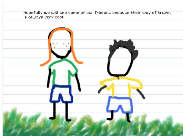
Figure 7: Illustration from Student e-book Our Journey to School

In this modern world where stereotypes rage within the media, it is important that the book underlies the idea of inclusion. The book was created to allow children from all backgrounds to be able to relate to either a character or a theme, furthermore, enhancing a child's self-esteem as it links to one of the three pillars for sustainable development, social equality, as they will feel accepted by society. (Student comment from rationale)