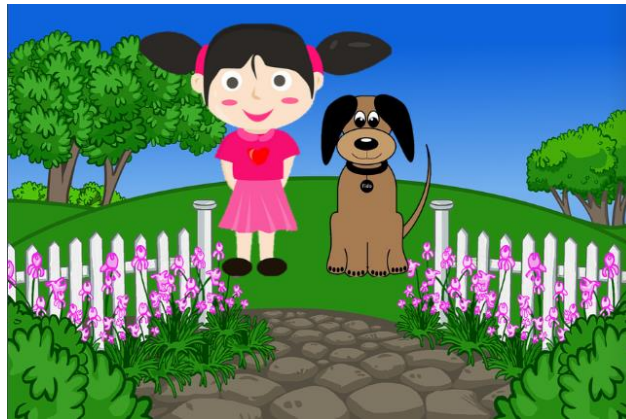
Figure 1: Illustration from Student e-book Fido's First Day Out

As evident from the excerpts above, students particularly celebrated the use of bright colours for children. This was readily witnessed in the e-books, as depicted in Figure 1: