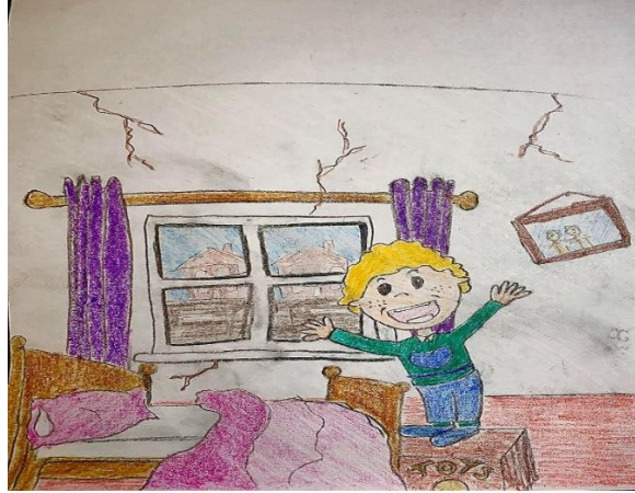
Figure 2: Illustration from Student e-book Maisie's Adventure